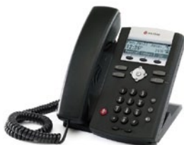
Basic IP Phone