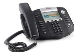
HD Manager IP Phone